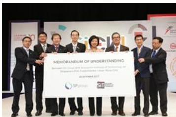
Key Announcements at SIEW 2017