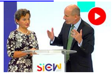
Highlights from Singapore Energy Summit: Integrating Renewables