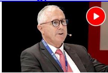
Highlights from Singapore Energy Summit