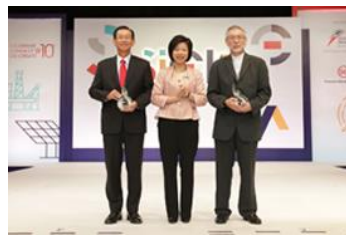
Singapore Energy Award 2017: Outstanding Leaders of Industry